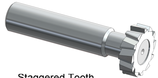
Staggered Tooth Shown Full Size (#807 Keyway Cutter)

All shanks are 1/2" Dia. and 2-1/2" overall